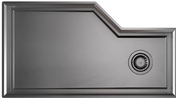
Sink Diade Gun Metal Fumè 3028 816